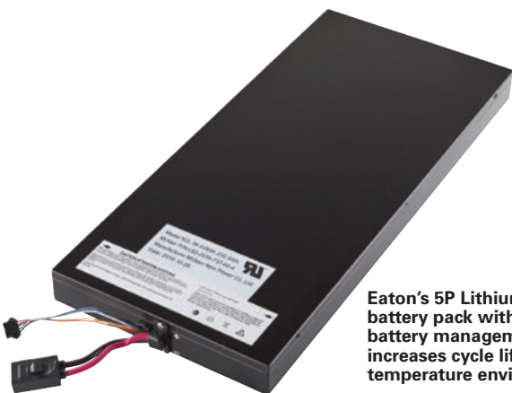
Eaton's 5P Lithium-ion battery pack with on-board battery management — increases cycle life in higher temperature environments.

Building on the success of the 5P UPS platform, Eaton has reduced the weight, improved battery life and lengthened our warranty. These added benefits, in combination with the extended life of the product, provide IT managers with the opportunity to align their UPS refresh cycles with the rest of the IT stack, saving time and money spent on labor and replacement batteries.